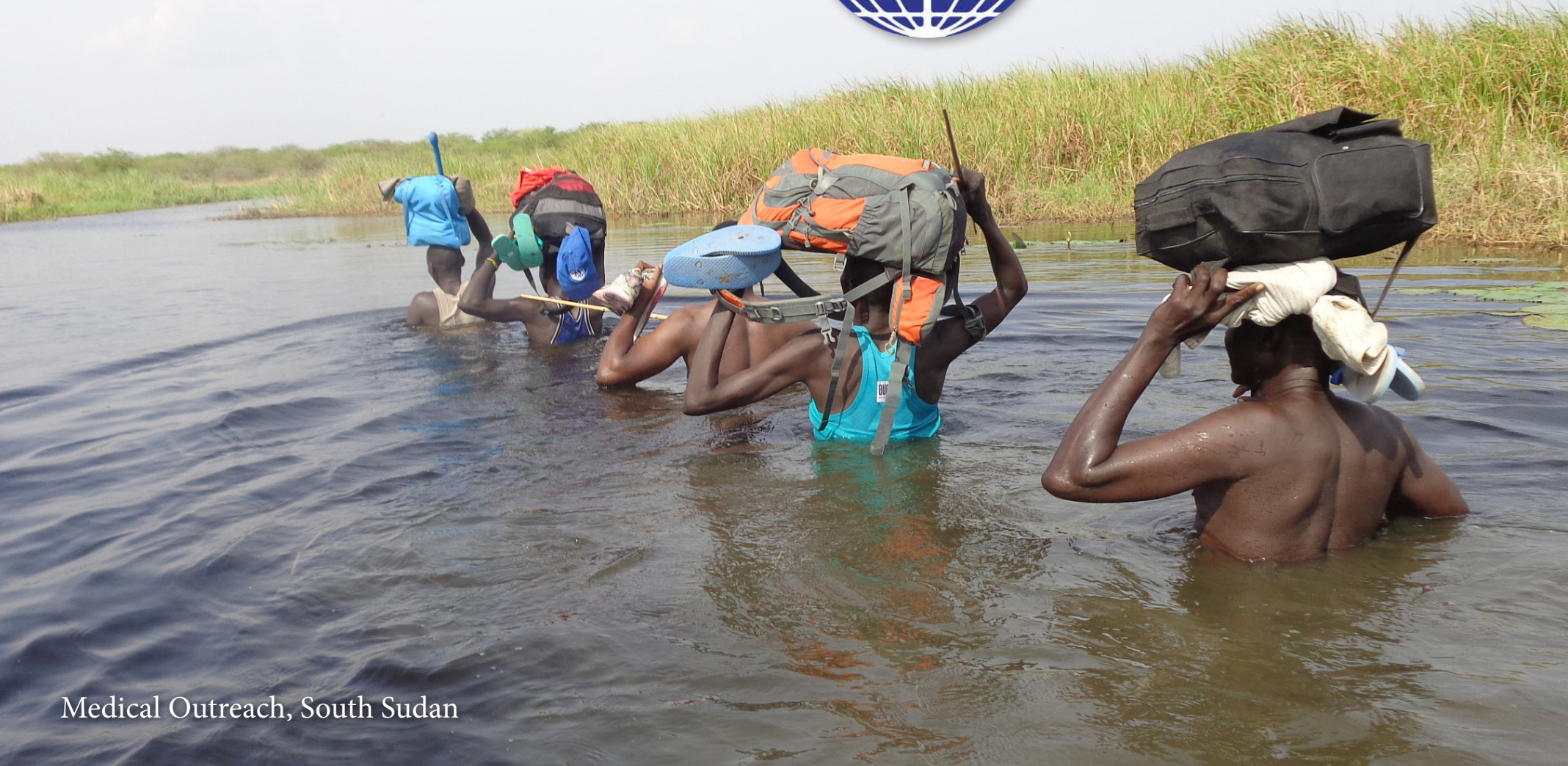
Medical Outreach, South Sudan

Christian Mission Aid where the resources meet the needs