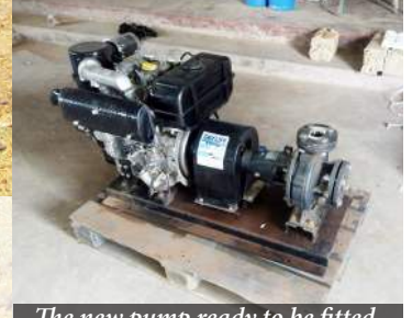
The new pump ready to be fitted.