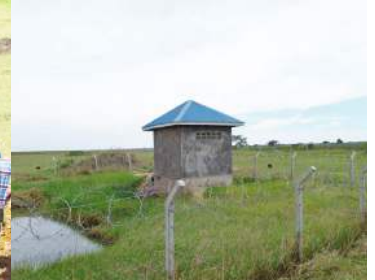
The pump house

Orisai Irrigation project will transform a whole community through food sufficiency with the planned irrigation of 5 acres