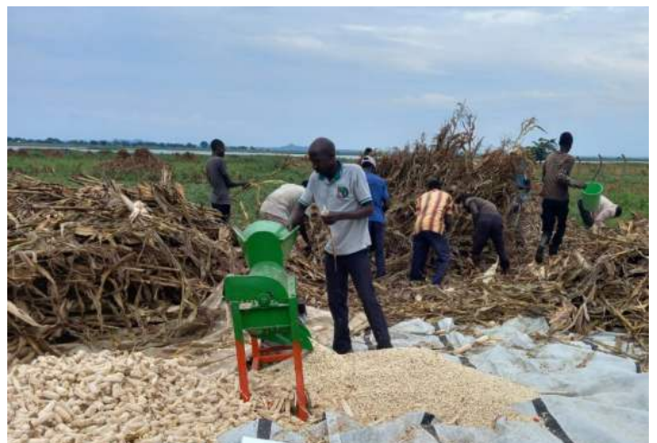
De-husking the maize harvest in preparation for sale at Orisai

200 members of the deaf community were empowered on financial and entrepreneurship skills in partnership with Kenyan partners. Through the skills and knowledge acquired, the deaf people will start new businesses or improve their existing ones.